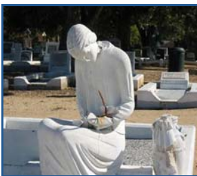
Remembering my Loved Ones

The cemetery is a place where a lot of grief feelings can be identified along with the object – most of the time the object will be the buried loved one. When I go to the cemetery and visit my Dad’s gravesite, I am happy as I remember all the good times we had. I am also sad because I miss him. Sometimes I have felt guilty about a few of those insignificant conflicts we had. All of these emotions are directed toward my father and the gravesite. That’s why we say a trip to the cemetery is a ritual. It means we remember the loved one and the relationship we had with the person who is now dead. We take the time to think about the past, perhaps talk to the loved one about what is happening in the present, then move on with our lives again.